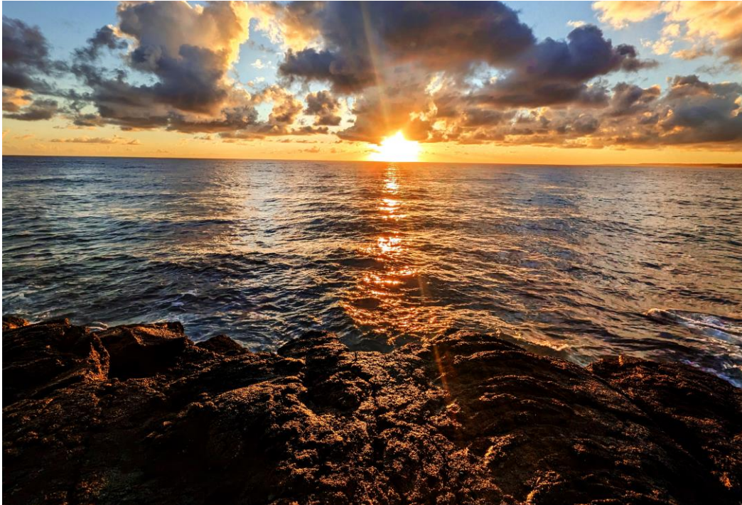
Ephemeral Sunrise: Big Island, HI