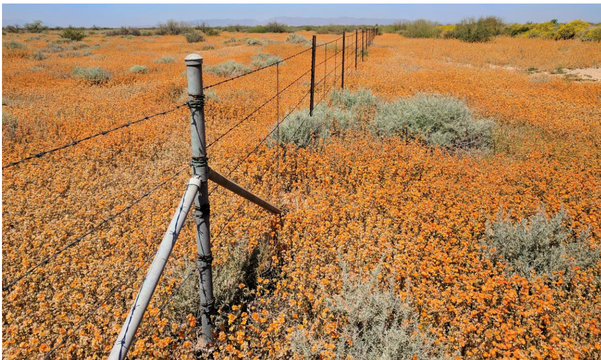
Fence: Along I-10 near Phoenix