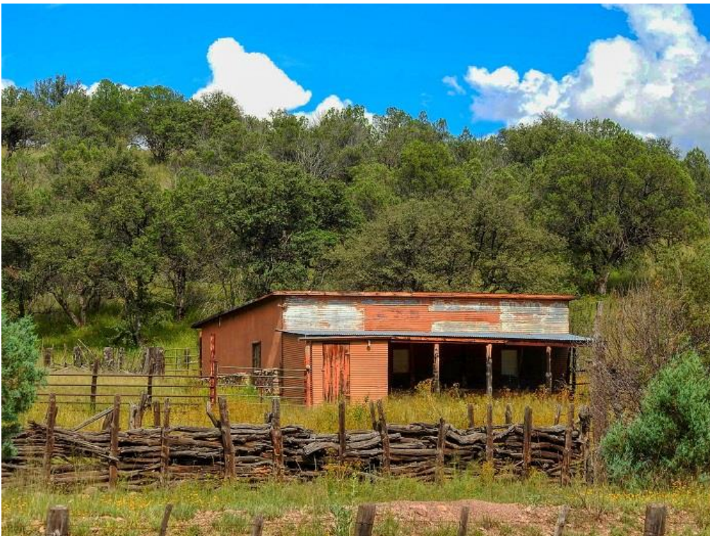
Fence: Lyle Canyon Road