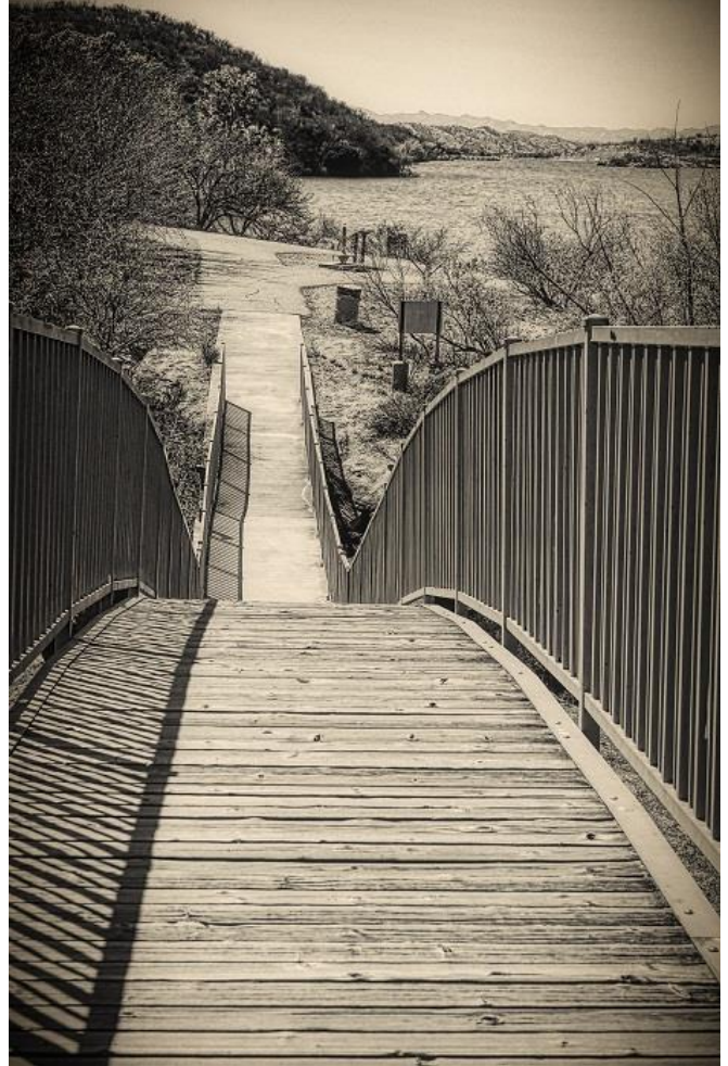
Fence: Patagonia Lake