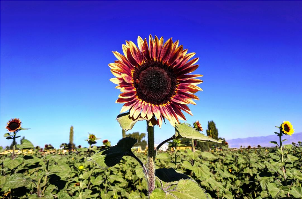
Harvest Apple Annies, Wilcox, AZ