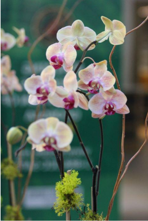
O is for...Orchid