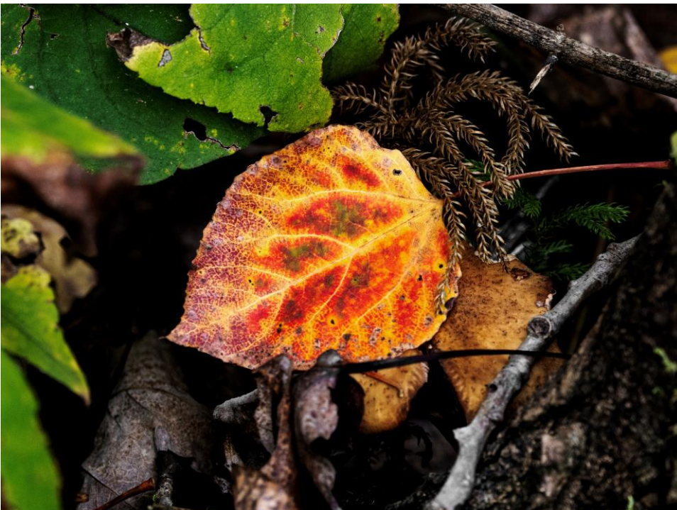
O is for ... Orange. Voyageurs NP, Minnesota