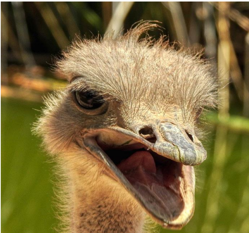
O is for ... Ostrich